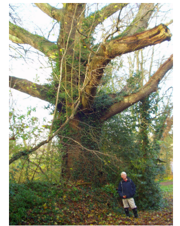
4. 350 year old oak on Path 19