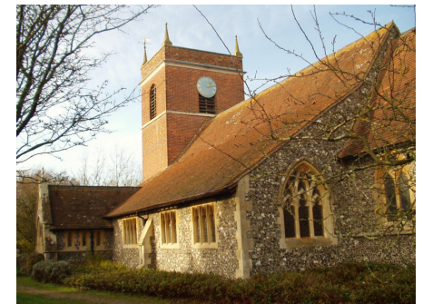
6. St Mary's church is the third on the site. Tower rebuilt 1794, the rest of the church 1860-71

BEENHAM PARISH COUNCIL Further details of paths can be downloaded at beenhamonline.org .