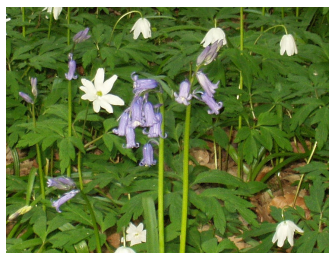
7. Old Copse is a Site of Special Scientific Interest and is rich in flowers and tree species