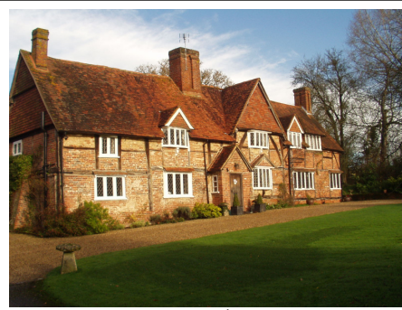
3. Butlers Farm. 16 th century.