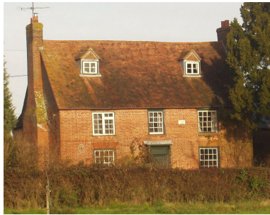
1. Awberry Farm – early 18 th century