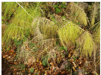
8. Clay Lane is a very ancient route from the Kennet Valley marshes and arable fields to the grazing on Bucklebury Common. Look for horsetail on the banks. A plant unchanged for millions of years. It was used to polish pewter.